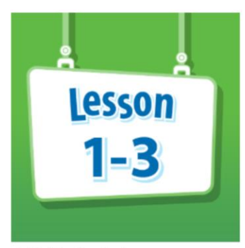
1-3: Decimals to Thousandths