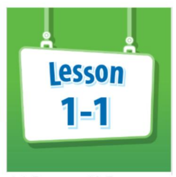
1-1: Patterns with Exponents and Powers of 10

Before we take the assessment on Topic 1, it is important to review the content that we learned about. This unit was about place value. Please click on each lesson and vocabulary below, watch the review video and practice the review questions to prepare for the test.